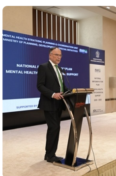
Prof Ahsan Iqbal Federal Minister MoPD&SI